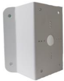
DS-1276ZJ-Y Wall Mount